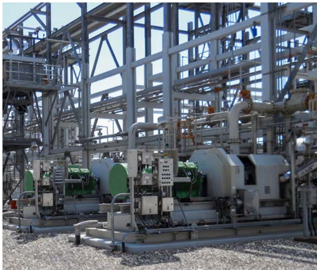
ZEECO Flare Gas Recovery System