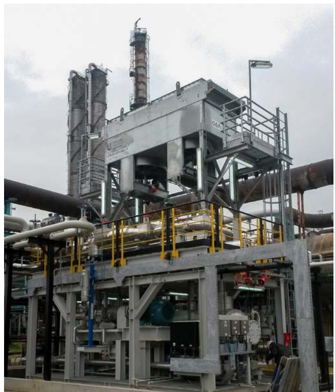
ZEECO Flare Gas Recovery System