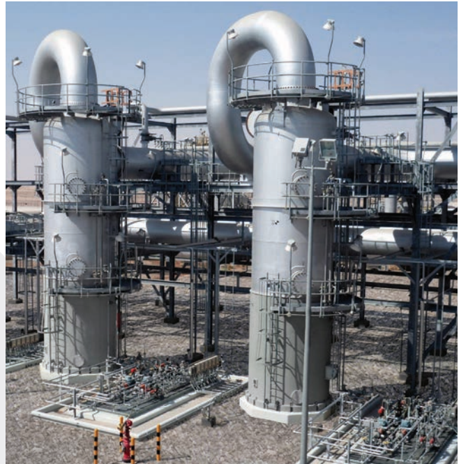
ZEECO Deep Liquid Seal Drums